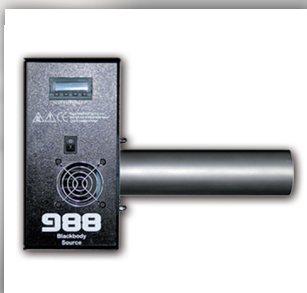
High Accuracy Infrared Thermal Calibration Source